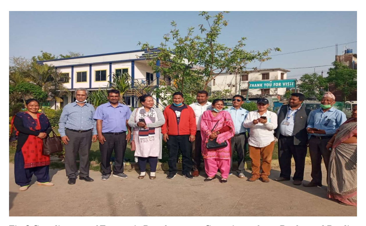
Fig.3 Coordinators of Economic Development Committee from Banke and Bardiya district