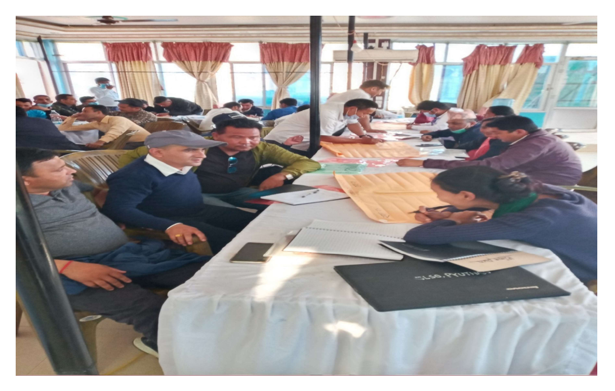
Fig.9 Participants from 10 palikas of Rolpa district for CBT conducted at Bhringri, Pyuthan from {}^{2}