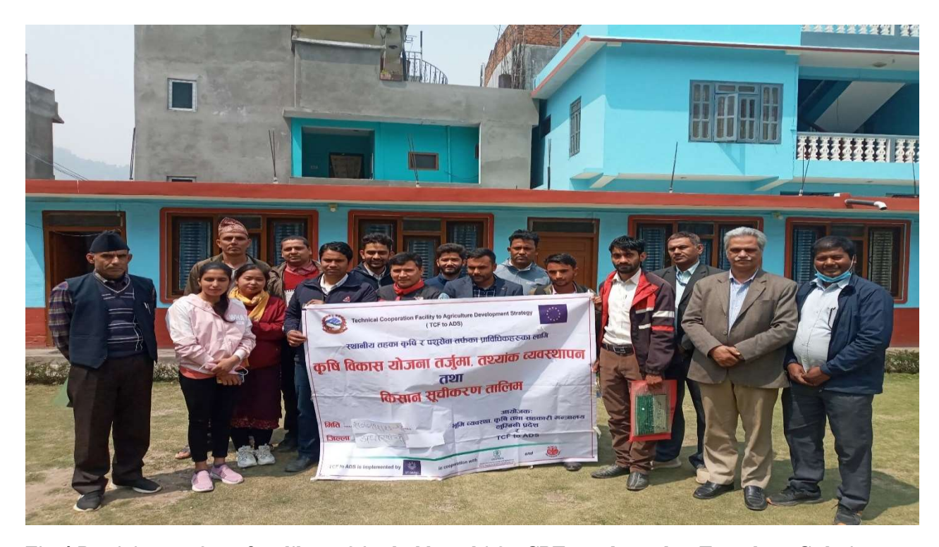
Fig.4 Participants from 6 palikas of Arghakhanchi for CBT conducted at Tamghas, Gulmi.