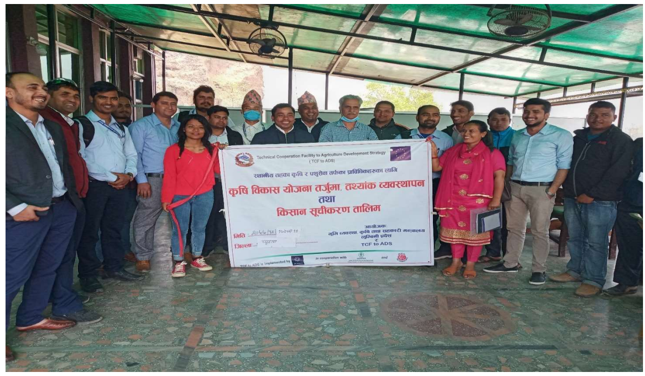
Fig.8 Participants from 9 palikas of Pyuthan district for CBT conducted at Swargadwari Hotel , Bhringri, Pyuthan