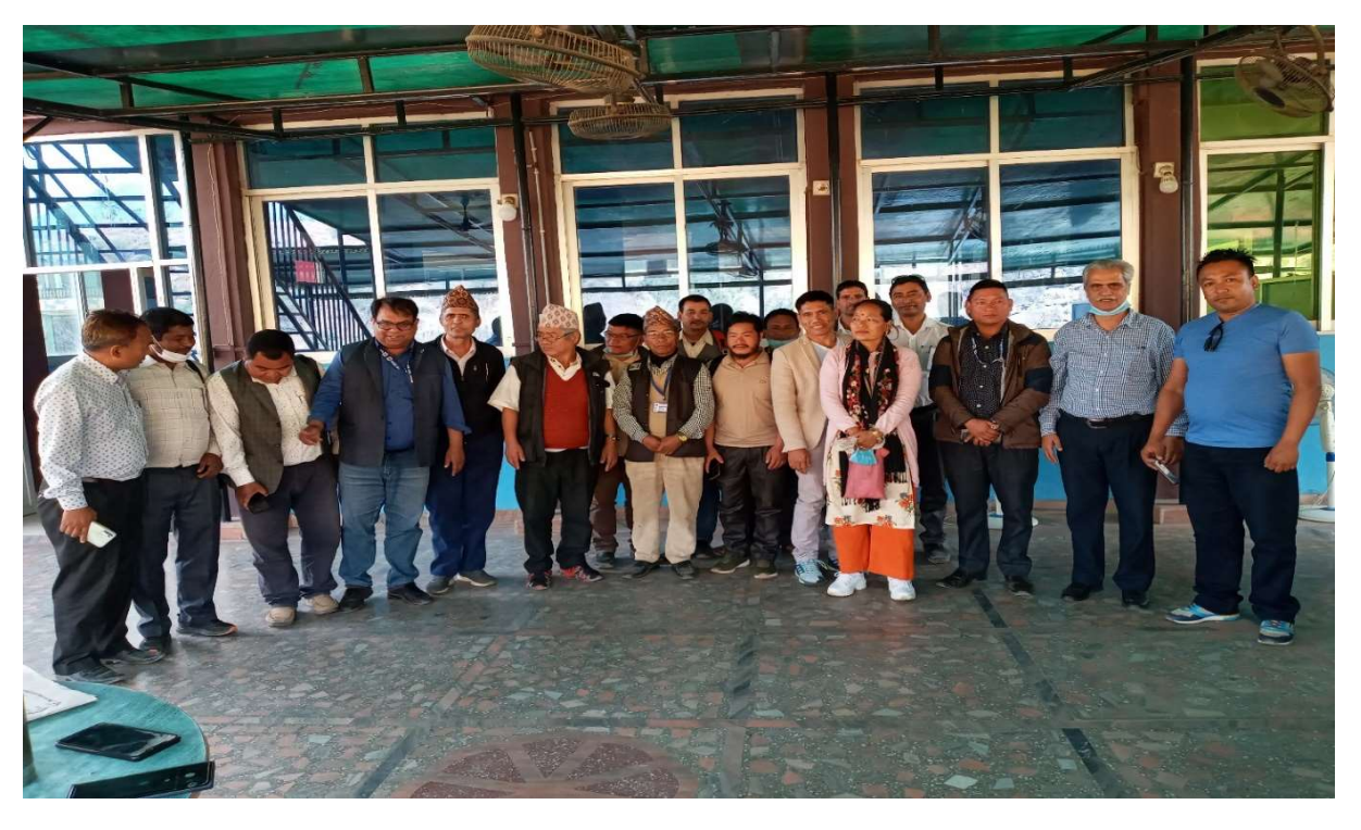
Fig.4 Coordinators of Economic Development Committee from Pyuthan and Rolpa district)