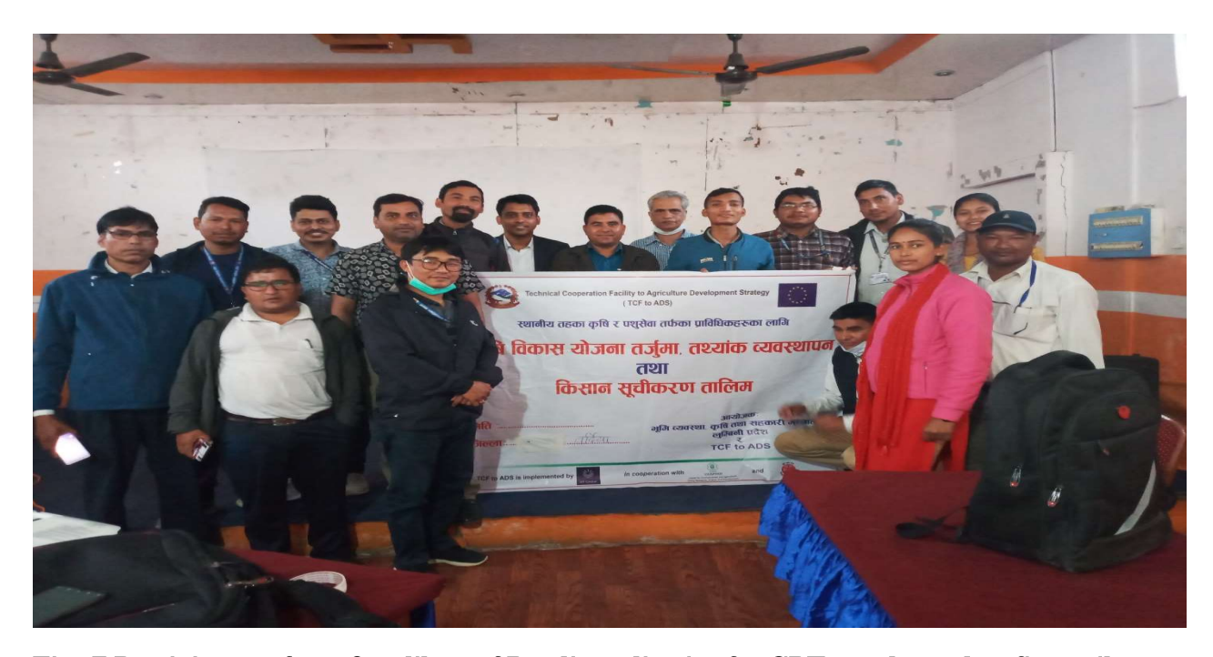
Fig. 7 Participants from 8 palikas of Bardiya \, district for CBT conducted at Swastik Hotel , Dhamboji, Nepalganj