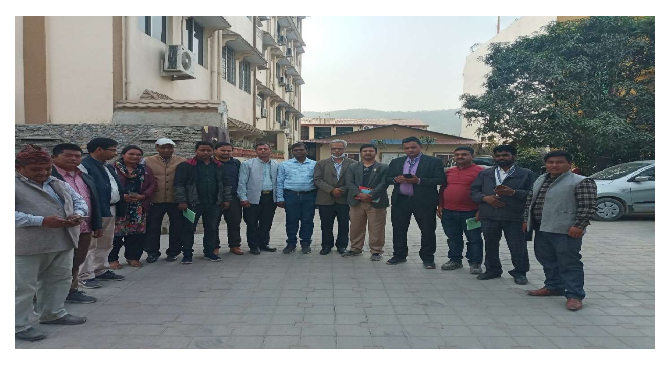
Fig.2 Coordinators of Economic Development Committee from Kapilvastu and Palpa district