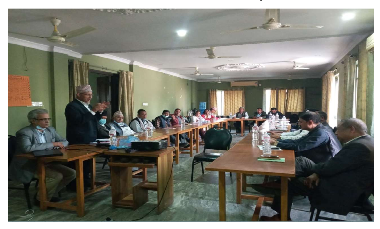
\begin{tabular}{ll} Fig. 1 Coordinators of Economic Development Committee from Rupandehi and Nawalparasi \\ \end{tabular}