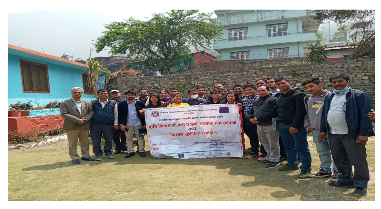
Fig.5 Participants from 12 palikas of Gulmi district for CBT conducted at Tamghas, Gulmi.