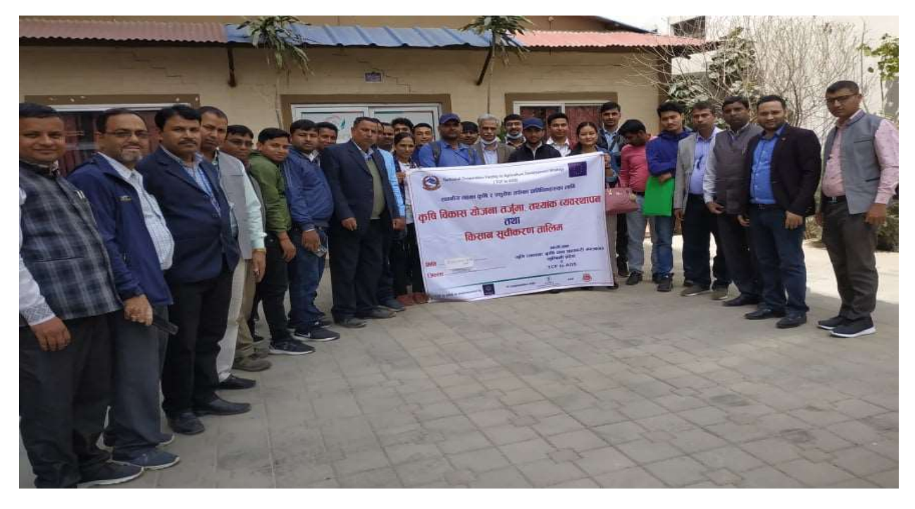
Fig.3 Participants from 10 palikas of Kapilvastu district for CBT conducted at New Era Hotel