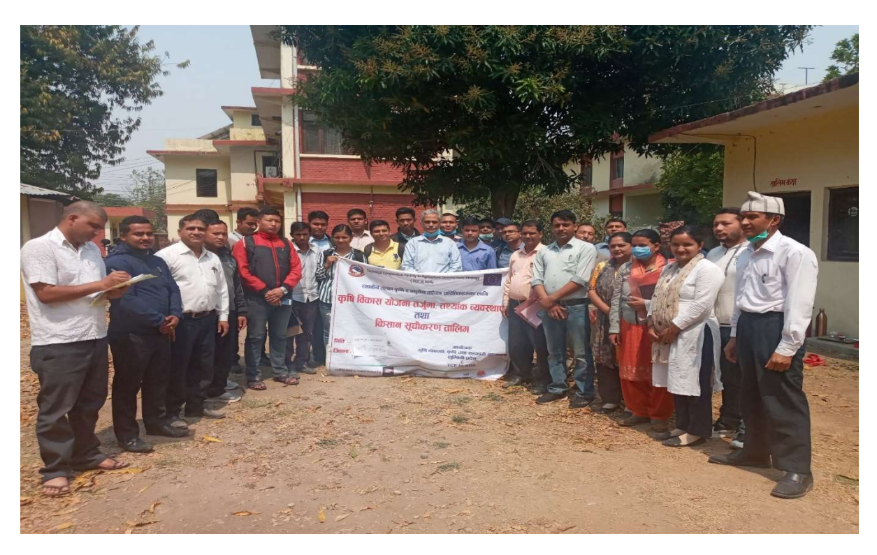
Fig. 10 Participants from 13 palikas of Dang and E. Rukum district for CBT conducted at AKC, Dang.