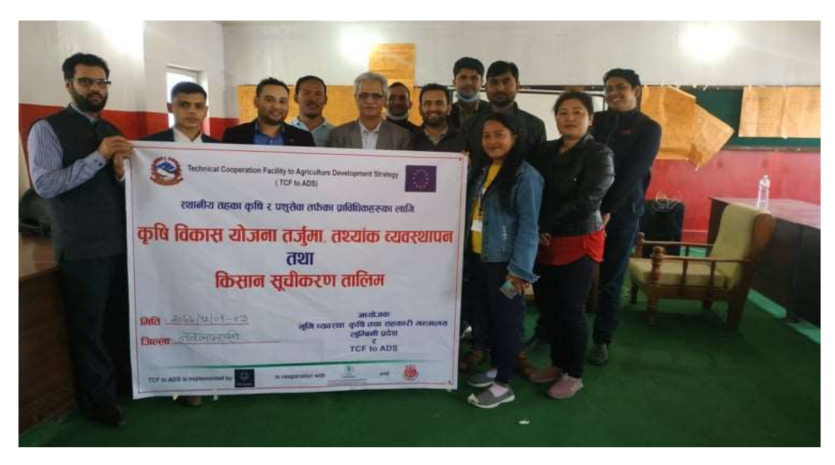
Fig.1 Participants from 7 palikas of Nawalparasi district for CBT conducted at New Era Hotel, Butwal.