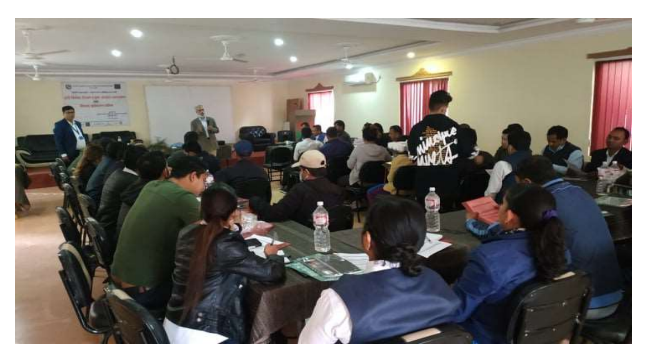
Fig.2 Participants from 16 palikas of Rupandehi district for CBT conducted at New Era Hotel, Butwal.