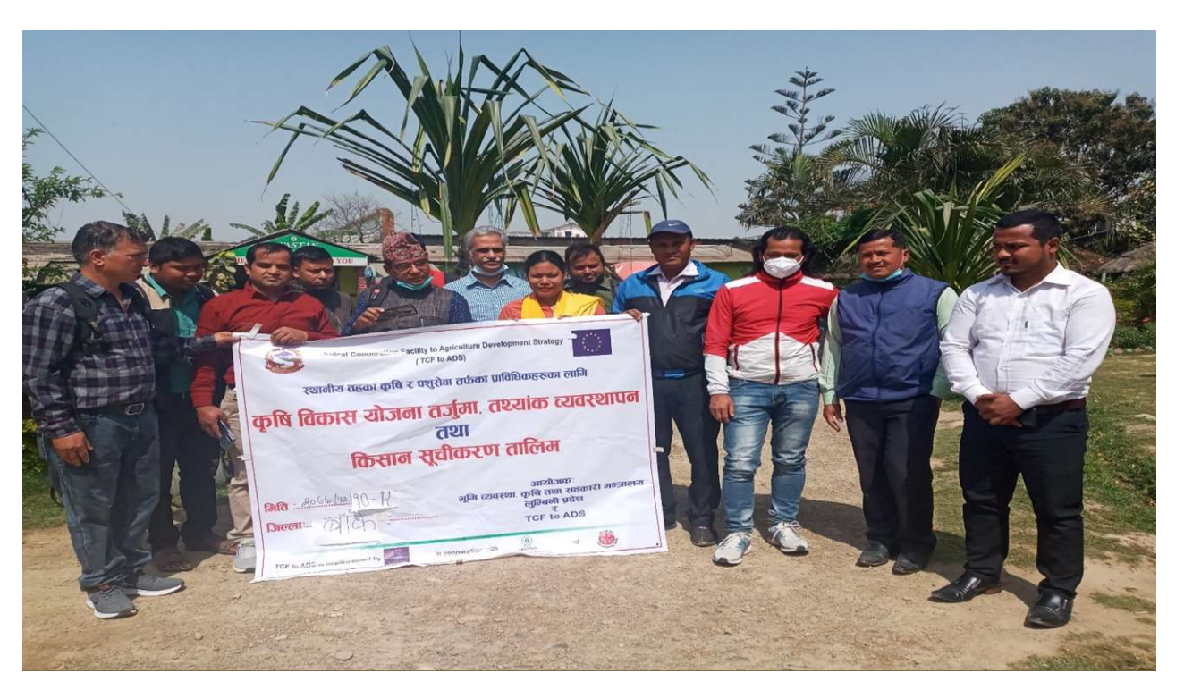
Fig. 6 Participants from 8 palikas of Banke district for CBT conducted at Swastik Hotel, Dhamboji, Nepalganj